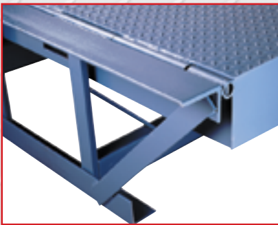
True Full Width Rear Hinge With Zinc Plated Rod