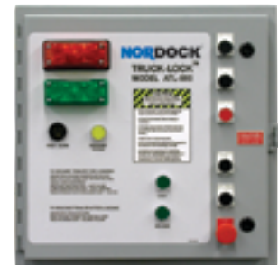
Optional LOGI-SMART™ Integrated Control Systems