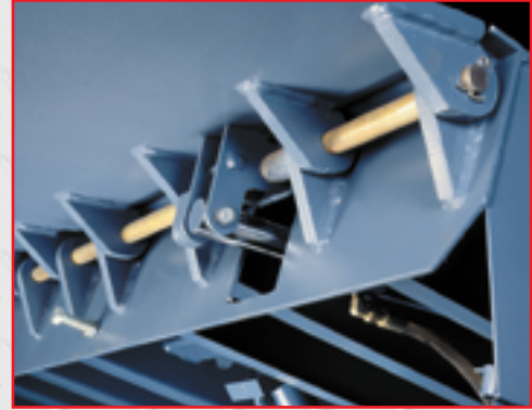
Exclusive Lip Lug & Header Plate Design

The front and rear hinge rods are SAE 1045 superior shaft, zinc plated and factory coated with anti-seize lubricant.